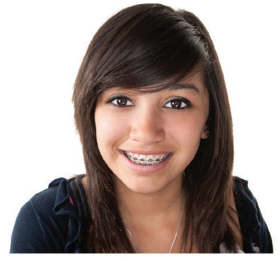
Who qualifies for the membership plan?